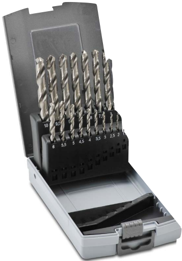
Jobber length drill set 214214RO shown