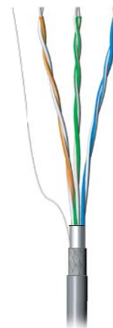
3 Twisted Pairs