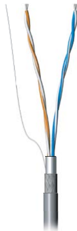
2 Twisted Pairs