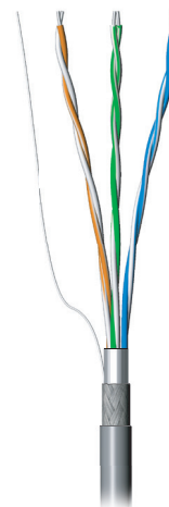
3 Twisted Pairs