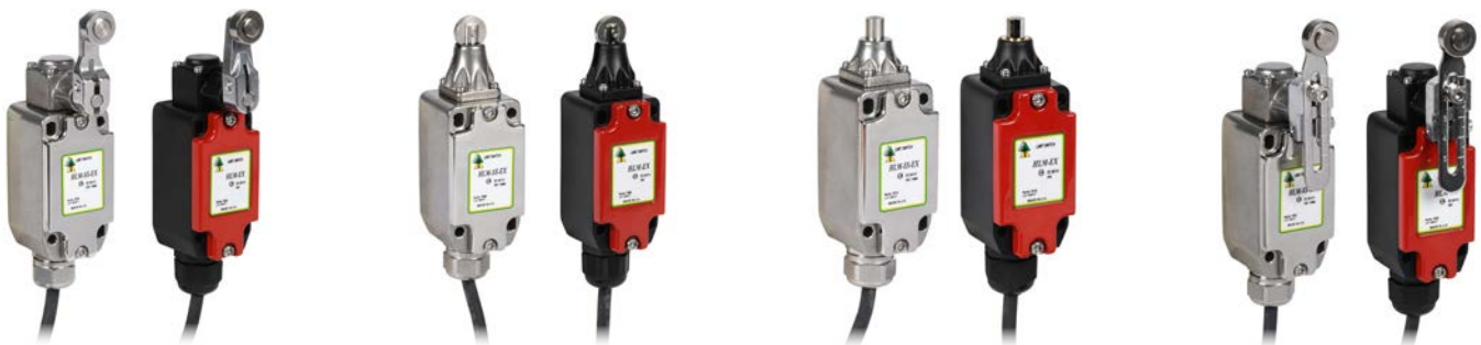
Side rotary lever HLM-EX-174015 HLM-SS-EX-175015