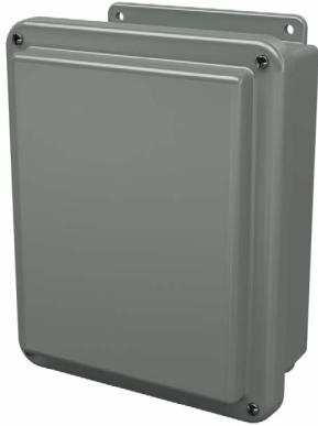
HW-J100805SC Crowned Cover Model Shown