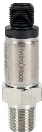
Part No. WPT25-20-0015H

The HydroMode WPT25 pressure transmitter series is UL Classified for NSF/ANSI/CAN 61 and 372, making it ideal for drinking water pressure measurement applications. Additionally, other media pressure sensing applications are possible due to the robust all stainless steel welded sensing element and wetted materials. The WPT25 series features full scale pressure ranges from 15 to 300 psig with a <1% Total Error Band over 0 to 50°C for optimum performance.