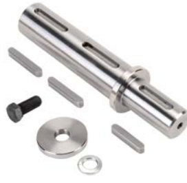
HBR-37-S Single Output Shaft