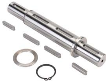
HBR-37-DS Double Output Shaft