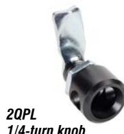
2QPL 1/4-turn knob