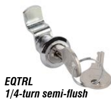
EQTRL 1/4-turn semi-flush