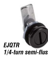
EJQTR 1/4-turn semi-flush