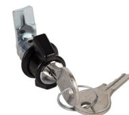
EJWKL 1/4-turn wing handle