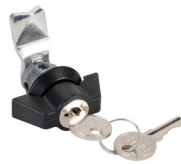
2WKL 1/4-turn wing handle