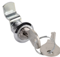
EQTRL 1/4-turn semi-flush