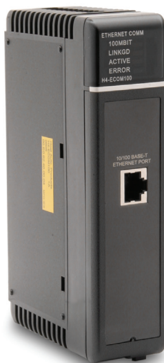
The H4-ECOM100 supports the Industry Standard Modbus TCP/IP Client/Server Protocol