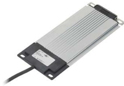
50W Flat Heater 061000-00