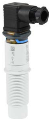
Part No. FTI26-CA4VWDG

The Endress+Hauser Nivector FTI26 capacitance point level switch is commonly used to detect the full or empty status in silos, hoppers, and bins containing powders or fine-grained bulk solids. When used as an empty status switch, it is typically mounted at an angled position near the bottom of the storage vessel to initiate refilling or turn off equipment for dry-running protection. When used as a full status switch, it is mounted near the top of the storage vessel to limit refilling or for overflow protection.