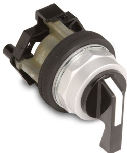
HT8JEH1D lever version