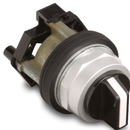
HT8JBH1D knob version