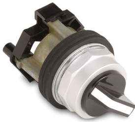
HT8JAH3A knob version