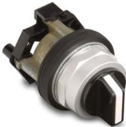
HT8JBH1D knob version