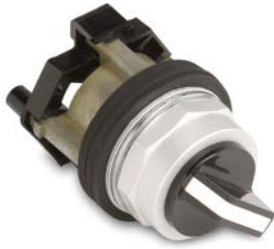
HT8JAH3A knob version