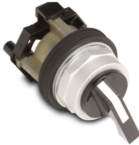
HT8JDH3A lever version