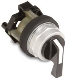
HT8JEH1D lever version