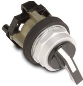
HT8JDH3A lever version