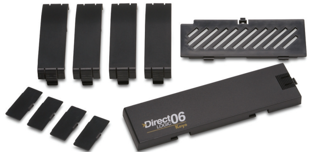
DL06 replacement terminal blocks, terminal block covers, terminal block labels and short bar D0-ACC-2