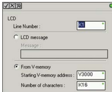
Message from PLC memory

Up to 16 characters of ASCII text can be displayed per line. In the example, K16 indicates that 16 bytes (8 words) of ASCII text is retrieved for display.