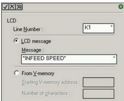
Simple text message