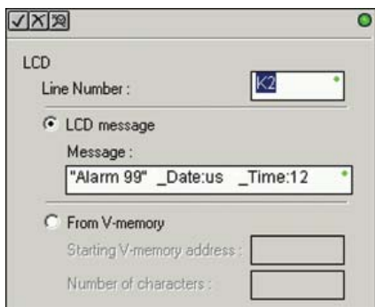
Message with embedded date and time

The LCD instruction in DirectSOFT gives the PLC programmer a convenient way to define screen messages. A literal string can be programmed using the LCD instruction. Embedding variables allows you to customize the messages for an application that involves changing values. The following example shows an embedded date and time on an alarm message: