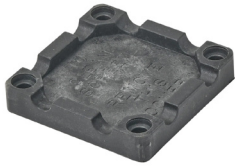
Part No. SF-5420-K