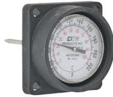
Part No. SF-9220-K

CITO StackFlow end caps can mount to the left- or right-hand inlet of the modular body. Caps can be blank or have an integral temperature or pressure gauge.