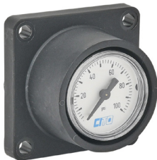
Part No. SF-9100-K