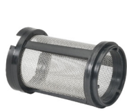
Part No. SF-9130

See www.AutomationDirect.com for a wide variety of fitting options