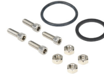
Part No. BK-9750