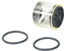
Part No. RTA-3903