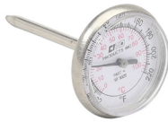
Part No. FT-200