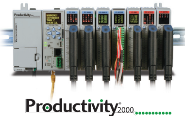
Productivity 2000 .....

The Productivity controllers shatter the price per feature paradigm in every category, with prices that can't be beat and a two-year warranty on all modules.