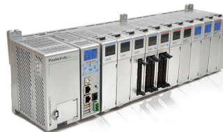
Productivity 3000 .....