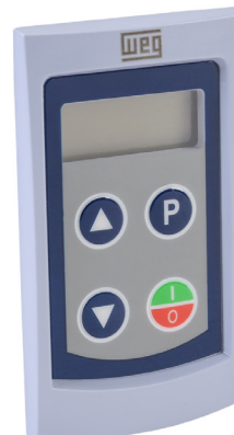
WEG AC Drives