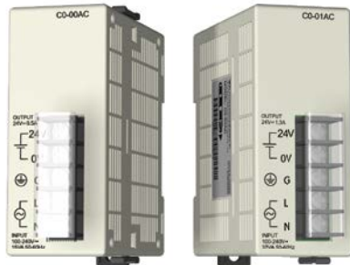
CLICK 24VDC Power Supply C0-00AC or C0-01AC

Refer to the Power Budgeting example shown on the following page. The table shows required current for a CLICK PLUS PLC, two I/O modules, and a C-more Micro. Use the total amperage values to select a suitable power supply.