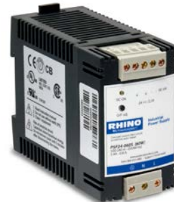
Other 24VDC Power Supply Example: PSP24-060S