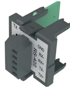
Removable Connector Included

PLCs via K-Sequence protocol, as well as devices that send or receive non-sequenced ASCII strings or characters.