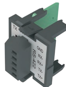
Removable Connector Included

PLCs via K-Sequence protocol, as well as devices that send or receive non-sequenced ASCII strings or characters.