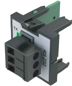
Removable Connector Included