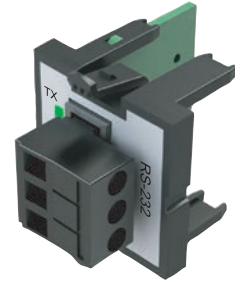
Removable Connector Included