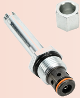
Part No. 51020850999

Bucher HPU Accessories include coils, replacement fluid filters, and unloader valve. The unloader valve 51020850999 is required to be installed in the manifold when using center closed or center float control valves. Refer to the manual for installation instructions.