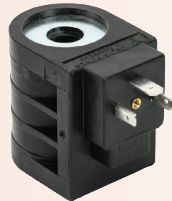
Part No. 51020191424