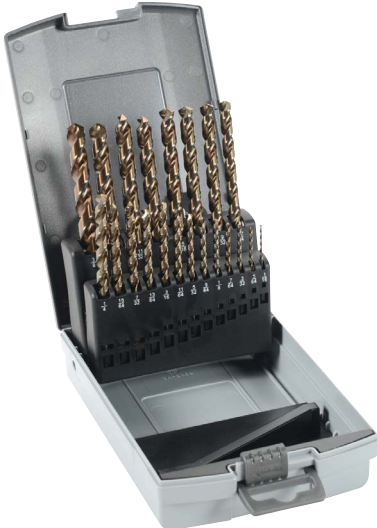
Black & Gold jobber length drill set 228850RO shown