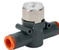
Inline Pressure Gauges