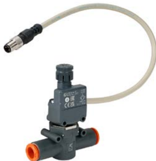
Inline Mechanical Pressure Switch