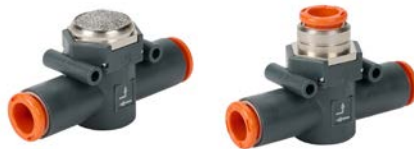
Inline Quick Exhaust Valves