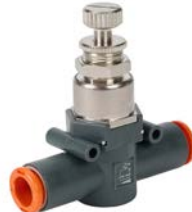
Inline Pressure Regulators