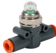
Inline Pressure Indicators