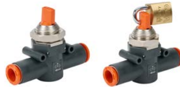
Inline Manual Shutoff Valves