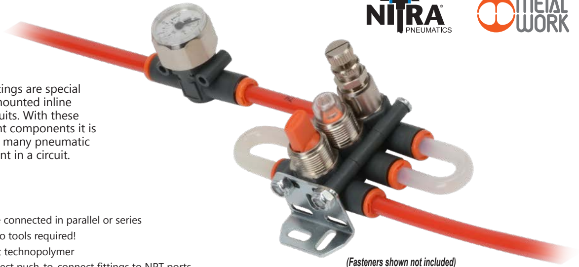
(Fasteners shown not included)

Pneumatic inline fittings are special purpose products mounted inline with pneumatic circuits. With these small, highly efficient components it is possible to perform many pneumatic functions at any point in a circuit.