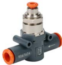
Inline Pilot Valves