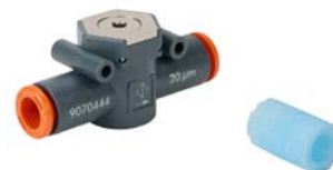
Inline Filter and Elements