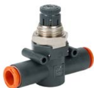
Inline Flow Control Valves