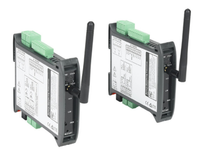
Part No. DEFINE-TWIN-LINK