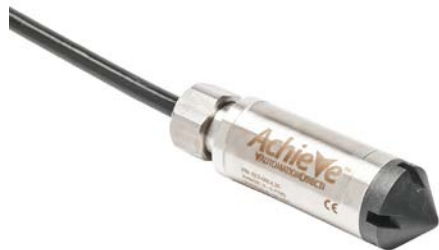
Part No. ELT-005-L30

The AchieVe ELT series is a very economical continuous level sensing solution for water applications where overall small size, weight, and very low cost are required.