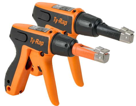
ABB - Thomas & Betts cable tie installation tools are designed for fast, consistent tensioning and flush cutting of cable ties in high-volume applications. The pistol grip design reduces hand fatigue during extended use. Two models are available to cover the full range of Ty-Rap cable tie widths.