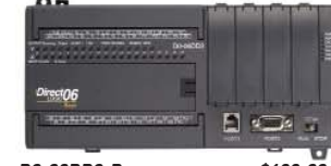
DO-06DD2-D $199.00 DC in/DC out/DC supply