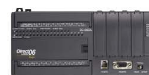
DO-06DA $259.00 DC in/AC out/AC supply