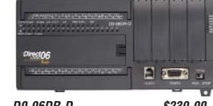
DO-06DR-D $239.00 DC in/Relay out/DC supply