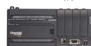
DO-06AR $259.00 AC in/Relay out/AC supply