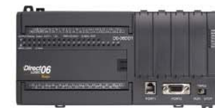
DO-06DD1 $199.00 DC in/DC out/AC supply

Check out the top six reasons why the DL06 is a great fit for discrete applications: