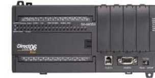
DO-06DD2 $199.00 DC in/DC out/AC Supply