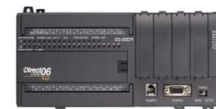
DO-06DR $229.00 DC in/Relay out/AC supply