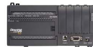
DO-06AA $275.00 AC in/AC out/AC supply