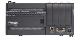
DO-06DD1-D $199.00 DC in/DC out/DC supply