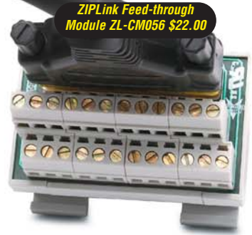
ZIPLink Feed-through Module ZL-CM056 $22.00