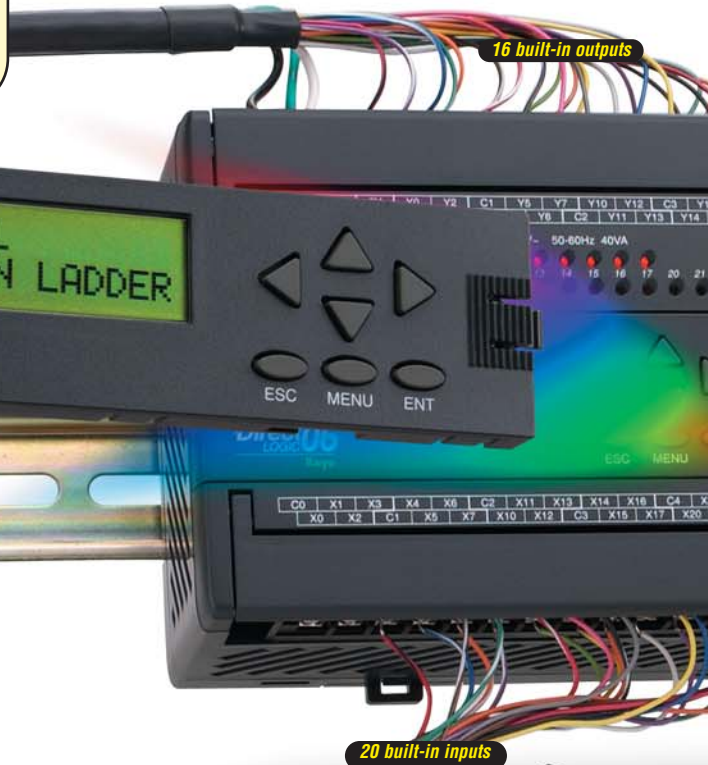
16 built-in outputs