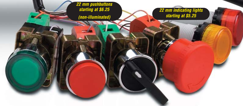
22 mm pushbuttons starting at $6.25 (non-illuminated)