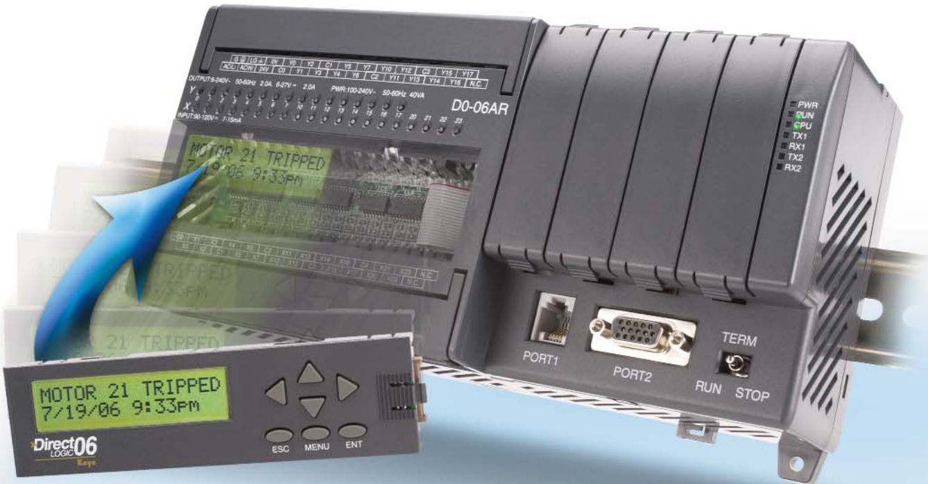
Two-line LCD display (D0-06LCD) $73