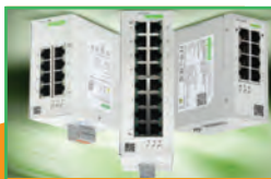
WAGO Lean Managed Switches Page 2

We're introducing NEW PRODUCTS every month, all at our EVERDAY LOW PRICES