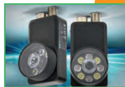
di-soric 2D Cameras Page 4