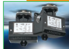
Ashcroft Pressure Switches Page 5