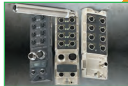
Balluff IO-Link Masters and Hubs Page 3

This issue of our Product News Bulletin will keep you up to date.