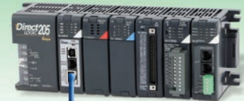
Ethernet Cable Connect to PLCs or other compatible master devices

Starting at: $499 .00 (MD4-0112T) 12 characters/1 line