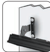
Wall mount brackets for easy mounting