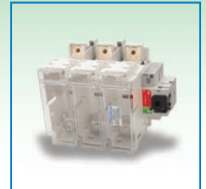
UL 98 Disconnect Switches starting at $88