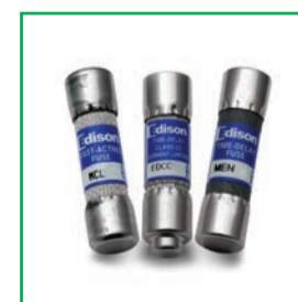
UL 248 General Fuses starting at $2.00 (5-pack)