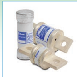
UL 248 Current Limiting Fuses starting at $37.50 (10-pack)