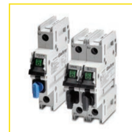
UL 98 and UL 508 Compact Fusible Disconnect Switches starting at $19