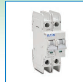
UL 489 Miniature Circuit Breakers, up to 40A starting at $18.00