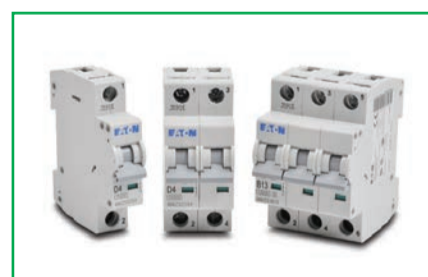
UL 1077 Supplementary Protectors starting at $9.00