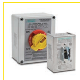
Bryant Manual Motor Controllers starting at $23.50