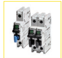
UL 98 and UL 508 Compact Fusible Disconnect Switches starting at $19