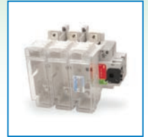
UL 98 Disconnect Switches starting at $88