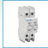
UL 489 Miniature Circuit Breakers, up to 40A starting at $17.50