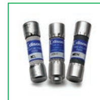
UL 248 General Fuses starting at $2.00 (5-pack)