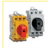
UL 508 Load Switches starting at $26