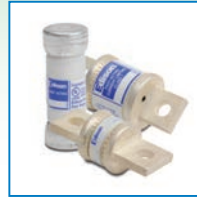
UL 248 Current Limiting Fuses starting at $37.50 (10-pack)