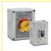
Bryant Manual Motor Controllers starting at $23.50