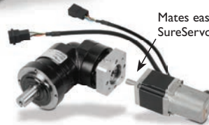
Mates easily to SureServo motors