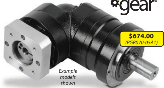
Example models shown