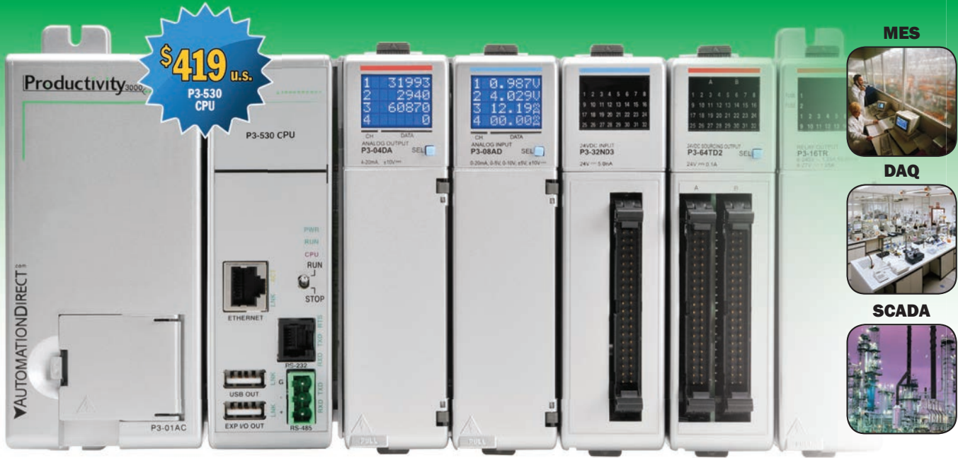
Productivity3000 programmable controller