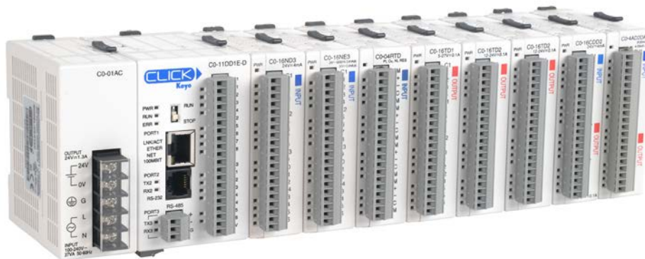
Figure 2: The CLICK Micro PLC can expand up to a total of 142 discrete I/O or 54 analog channels using 24 different digital and analog modules, including AC, DC, relay, thermocouple and RTD for more complex applications.

The CLICK comes in a variety of models with built-in I/O and removable terminal blocks for easy wiring. Additional modules can be added to expand I/O if needed. The CLICK CPUs include different combinations of discrete and analog inputs and discrete and analog outputs. It can be expanded to a total of 142 discrete I/O or 54 analog channels (Figure 2). The CLICK starts at a cost of $69, a price point common for many programmable relays, while delivering much more functionality and flexibility.