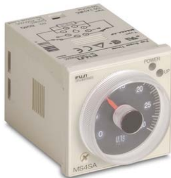
Figure 3: This Fuji Timer Relay is a cost-effective solution for applications requiring only a single timer output function.

A very simple programmable relay, specifically a timer relay, with an octal base, dip switches and a potentiometer to select function modes and time, includes only a 4-page user manual, so it is easy to use. If an application requires only a single, heavy-duty SPDT electro-mechanical output relay with on-delay, off-delay or interval output, this type device is a good choice (Figure 3).