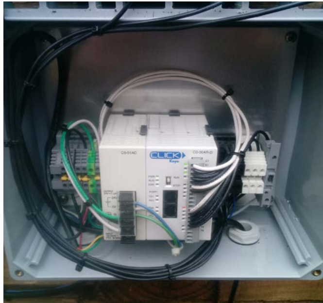
Figure 4: A CLICK micro PLC is often a better choice than a programmable relay for all but the simplest and most basic applications.

Due to recent technical developments, micro PLCs are no longer just relay and timer replacers, but can replace programmable relays in many applications. It should be clear from the examples given above that it is incorrect to think that a micro PLC solution is more expensive than a programmable relay. In fact, a CLICK micro PLC will cost less up front in all but the simplest applications. It is also not true that the PLC will take more time to program and will require more training (Figure 4).