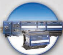
Universal Field I/O