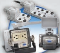
I/O and Communications Wiring