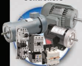
Motors and Motor Controls