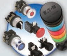
Pushbuttons, Switches and Lights