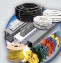
Terminal Blocks and Wiring