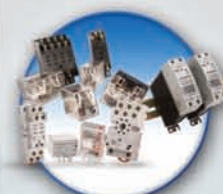
Relays & Timers