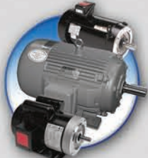
Motors and Worm Gearboxes