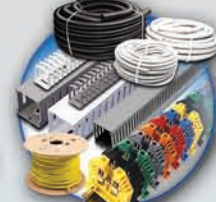
Terminal Blocks and Wiring