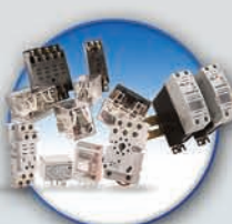
Relays & Timers