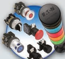
Pushbuttons, Switches and Lights