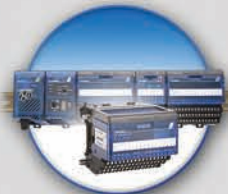
Universal Field I/O