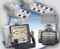
I/O and Communications Wiring