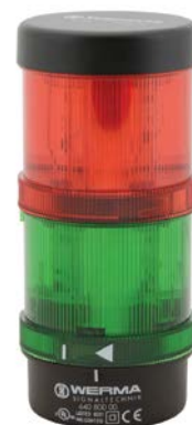
64924003 and 64924004