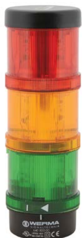
64924001 and 64924002