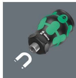
Bit Holder w/ Magnet