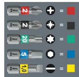
Take-it-Easy Tool Finder