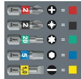
Take-it-Easy Tool Finder