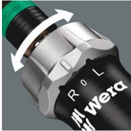
Directional Ratchet Switch