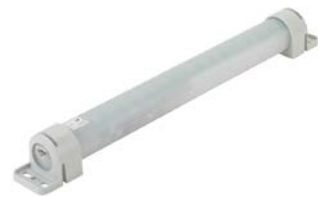
LED 021 Movement sensor and screw mount 021000-00