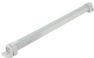
LED 022 On/off switch and magnet mount 022000-30