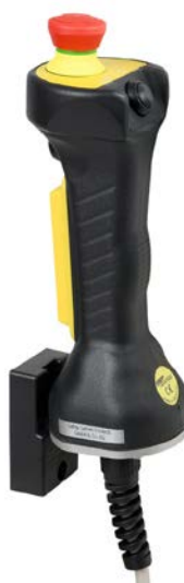
ZEUS11-131430 resting in the ZEUS-H glass-fiber reinforced mounting bracket