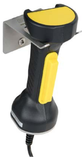
ZEUS01-000000 resting in the ZEUS-H2 stainless steel mounting bracket