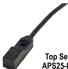
Top Sensing APS25-8S-E-D