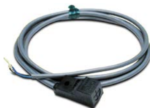
Front Sensing APS4-12M-E-D