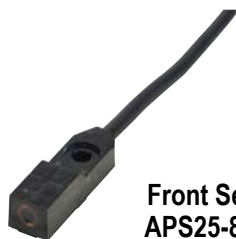
Front Sensing APS25-8M-E-D