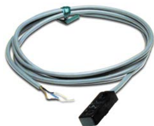
Top Sensing APS4-12S-E-D