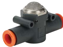
Inline Quick Exhaust Valves from $8.75