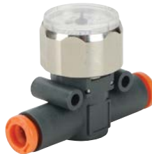
Inline Pressure Gauges from $17.75