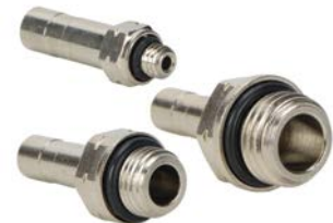
Stem Adapters from $3.25