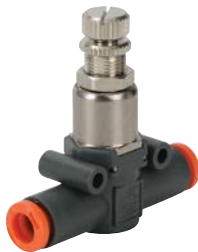
Inline Pressure Regulators from $20.25