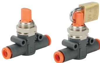
Inline Manual Shutoff Valves from $11.25