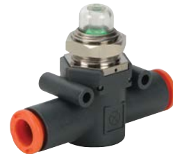
Inline Pressure Indicators from $11.75