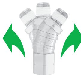
45° Swivel Design