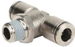
Part No. MBT14-18N-B

NITRA pneumatic push-to-connect male branch tee fittings with rotating nickel-plated brass body, nickel-plated brass threads, stainless steel tube gripping claws and pre-applied Teflon thread sealant (#10-32, M5 and G threads have O-ring instead of thread sealant). For use with flexible tubing. Five fittings per package.